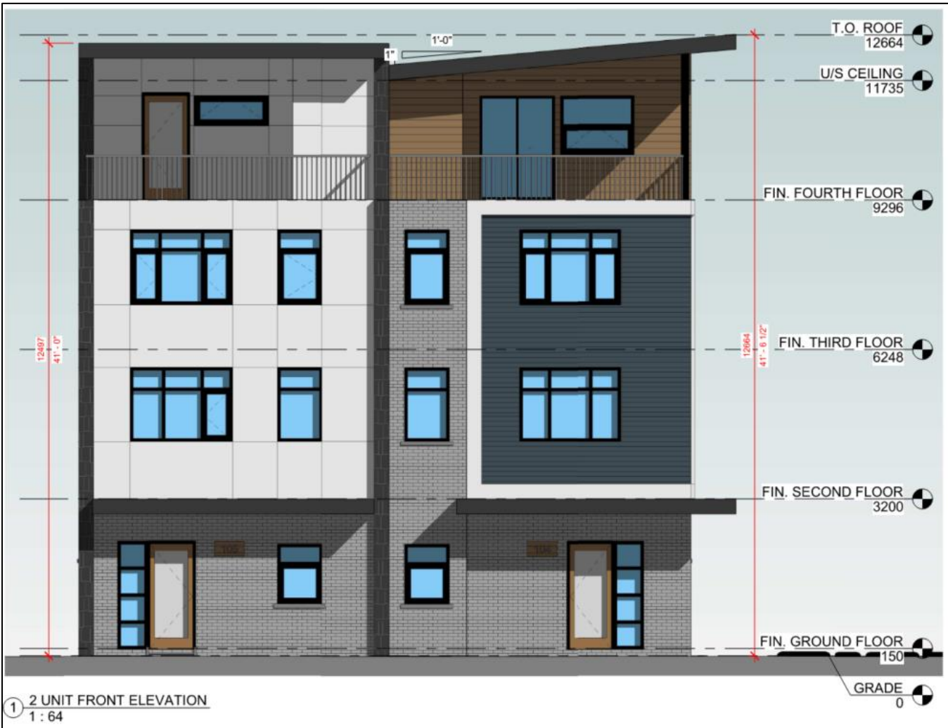
Figure 2: Elevation drawing of the proposed Group or Cluster Dwellings on the subject lands.