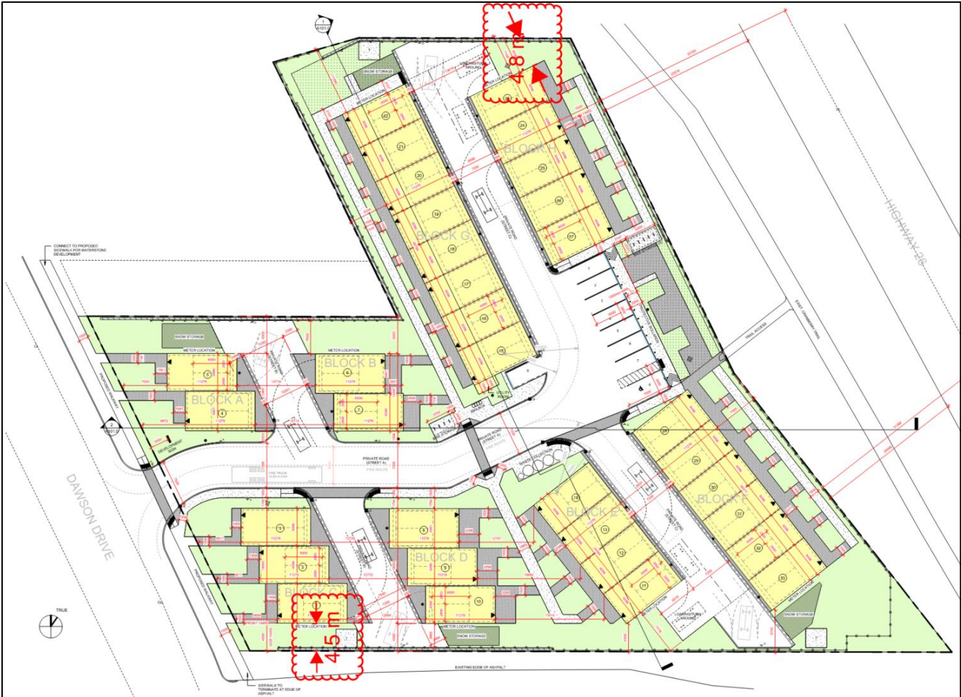
Figure 1: Site Plan of the proposed Group or Cluster Dwellings on the subject lands showing proposed setbacks. Setbacks requiring relief are shown in overlays.